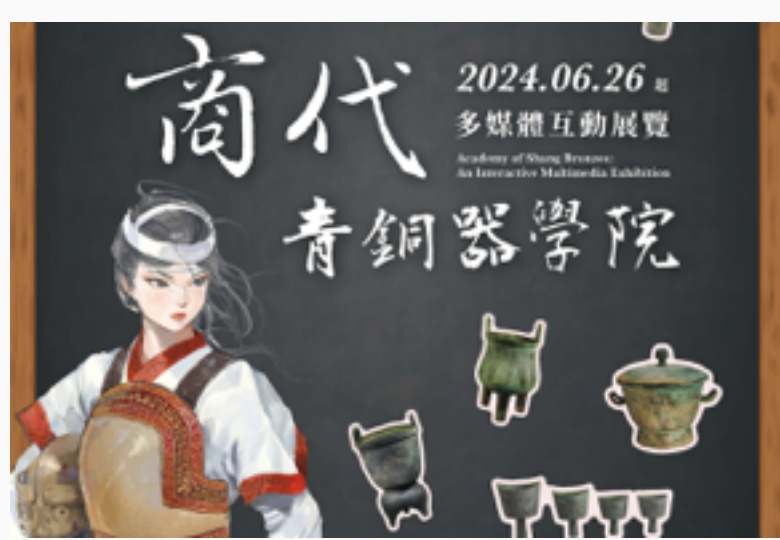
Academy of Shang Bronzes: An Interactive Multimedia Exhibition