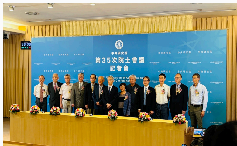
2024 Academicians and Honorary Academicians Announced