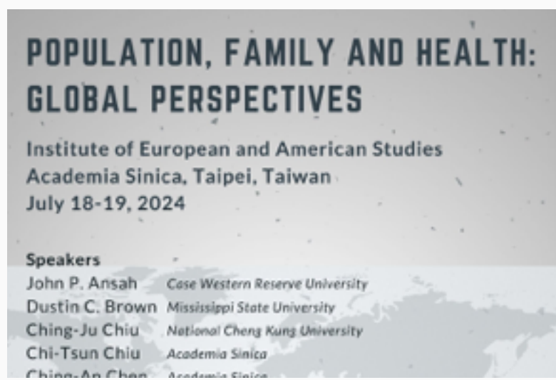
Population, Family and Health: Global Perspectives

EurAmerica, Vol. 54, No. 2 is now available